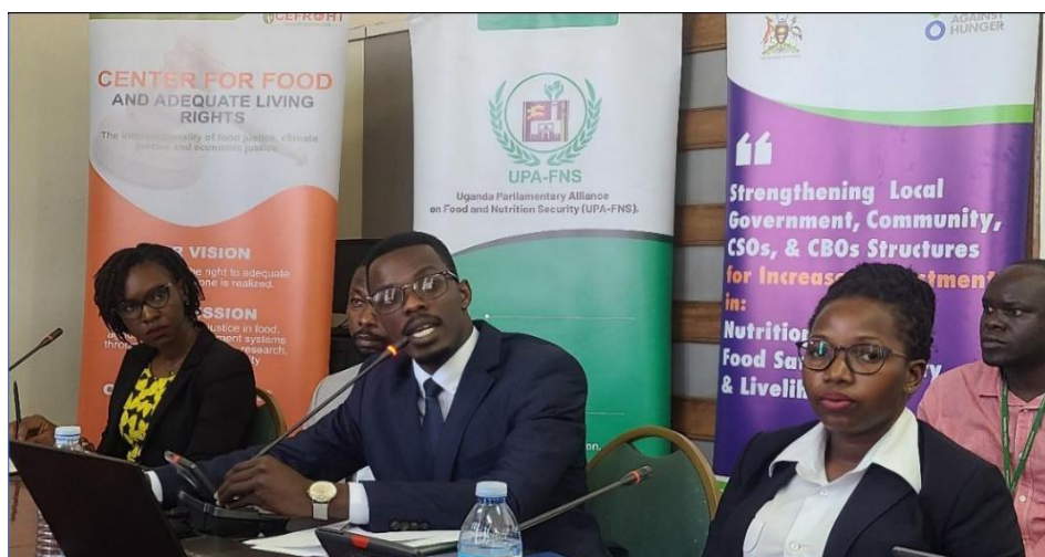
CEFROHT delivering a press statement ahead of the Parliamentary Nutrition Week.

CEFROHT's commitment extended beyond the walls of Parliament. The team travelled to Tooro Sub-region to engage with the local community through a series of impactful initiatives such as radio talk shows, local government and community engagements.