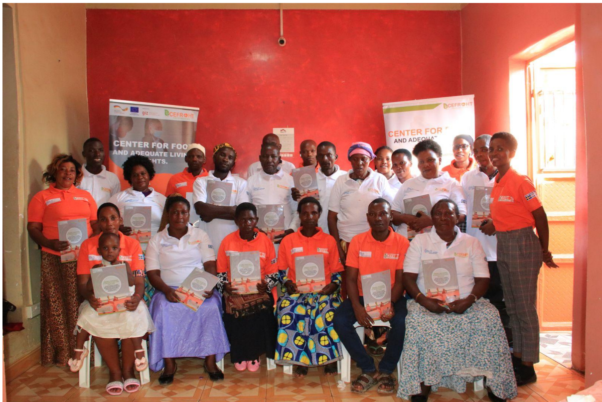
A group photo of the some of the CAGs