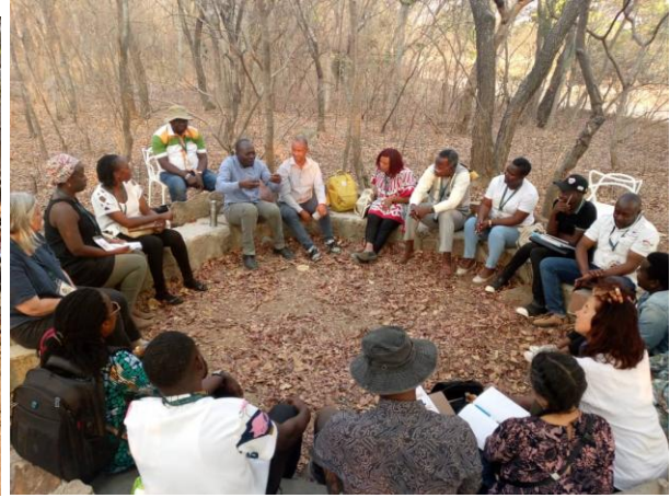
Agroecology Actors at the AEF tripartite event.