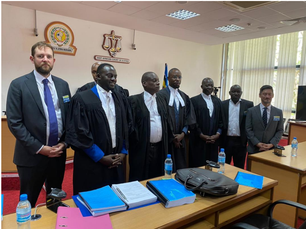
A team of lawyers before the East African Court of Justice in Arusha during case hearing.