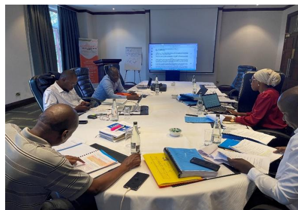
A team of lawyers handling the EACOP case at some of the litigation surgeries