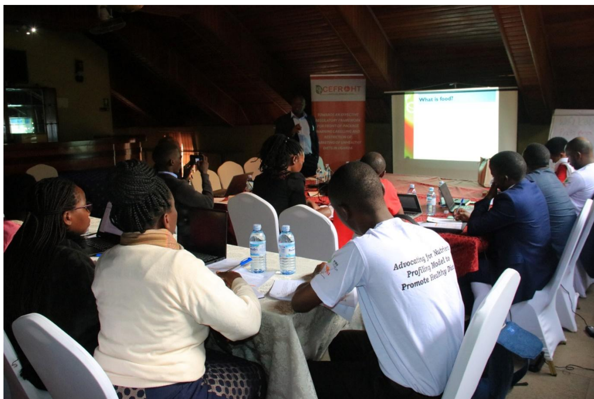
The UNCC-FOPWL quarterly meeting

intensify advocacy campaigns towards formulation of the NPM & FoPWL regulations and these included: (i) Deeply engage the food, nutrition, health and NCDs committees of Parliament; (ii) Intensify campaigns through main stream media and social media and appeal to the public for a call to action for their support towards a public petition; and (iii) Co-opt strategic partners such as UNICEF, FAO, WHO, IDRC as well as local partners to build a strong movement of champions.