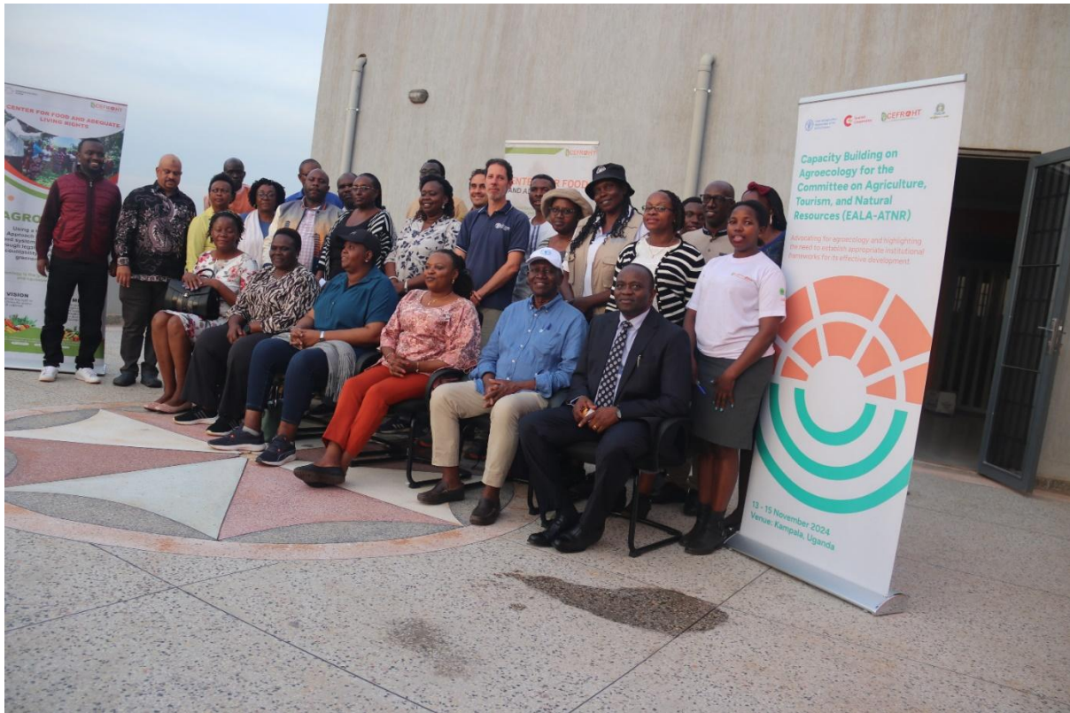
Members of the committee pose for a group photo at CEFROHT offices.

The capacity building generated commitment and a resolution from the chairperson EALA-ATNR to recognize agroecology as a strategic priority of the committee for formulating and recommending sustainable policies in Agriculture, Tourism and Natural Resource Management in the East African region. This reaffirms the commitment to advancing agroecology in East Africa, highlighting the dedication to protecting the environment, improving food security, and enhancing community well-being.