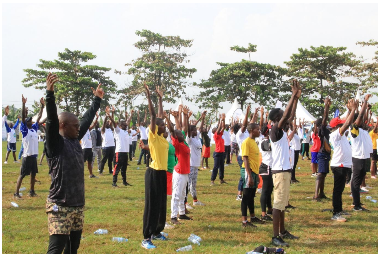
Participants at the National Day of Physical Activity.

The event was graced by High-level government officials including the Minister of Health who participated, demonstrating the government's commitment to promoting physical activity. The World Health Organization country director for Uganda also participated, highlighting the global importance of physical activity and Uganda's alignment with international health initiatives.