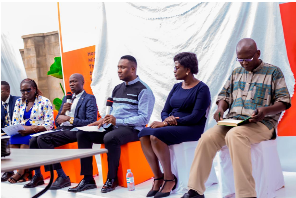
A panel discussion consisting of the Commissioners for Policy from Ministries of Agriculture, Health and Trade, Academia, Researchers, Uganda Human Rights Commission at the World Food Day Celebrations.

The policy dialogue also entailed exhibitions of safe agroecology produce: indigenous seed, organic input, fresh products and value-added products with live experiences and success stories from the smallholder agroecology farmers.