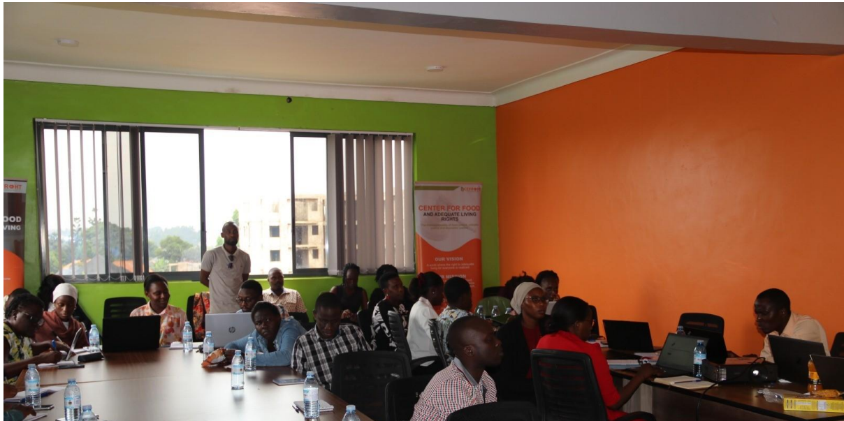
Enumerators at the capacity building training.

The Assistant Commissioner Nutrition at MoH and Nutrition experts building the capacity of enumerators to effectively collect data on processed and Ultra-processed products around the country.