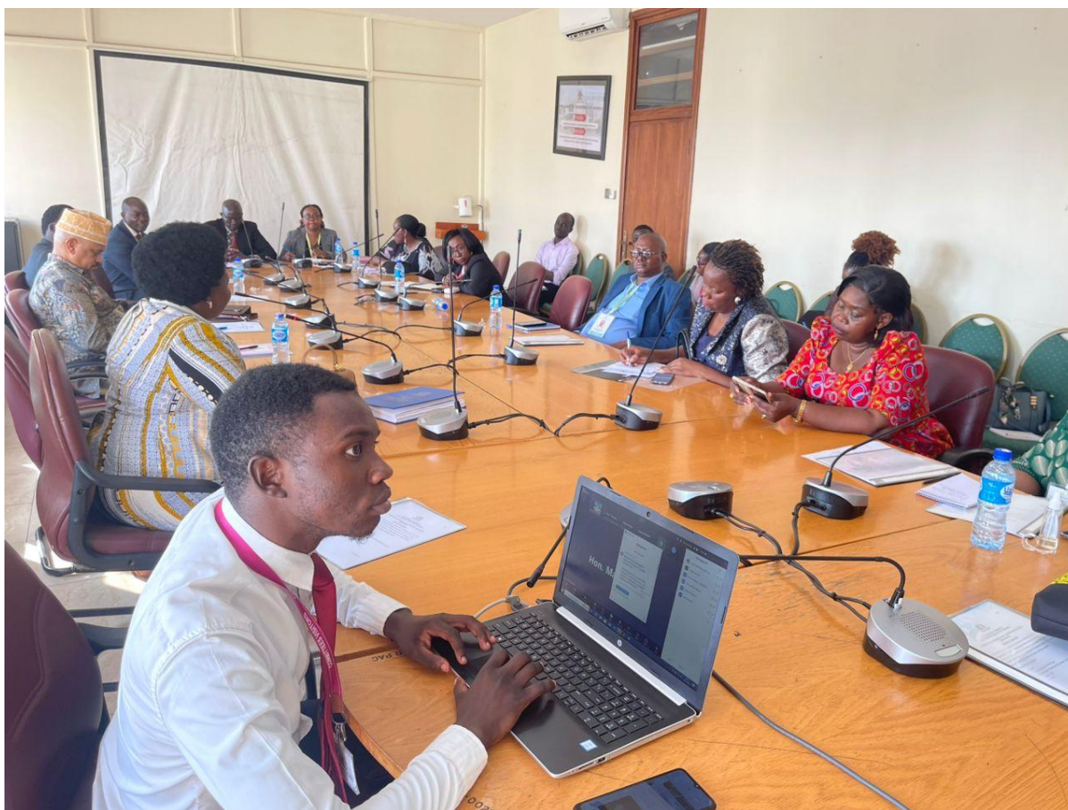
Capacity building of the EALA-ATNR committee on agroecology as a panacea to food and nutrition security and food sovereignty.