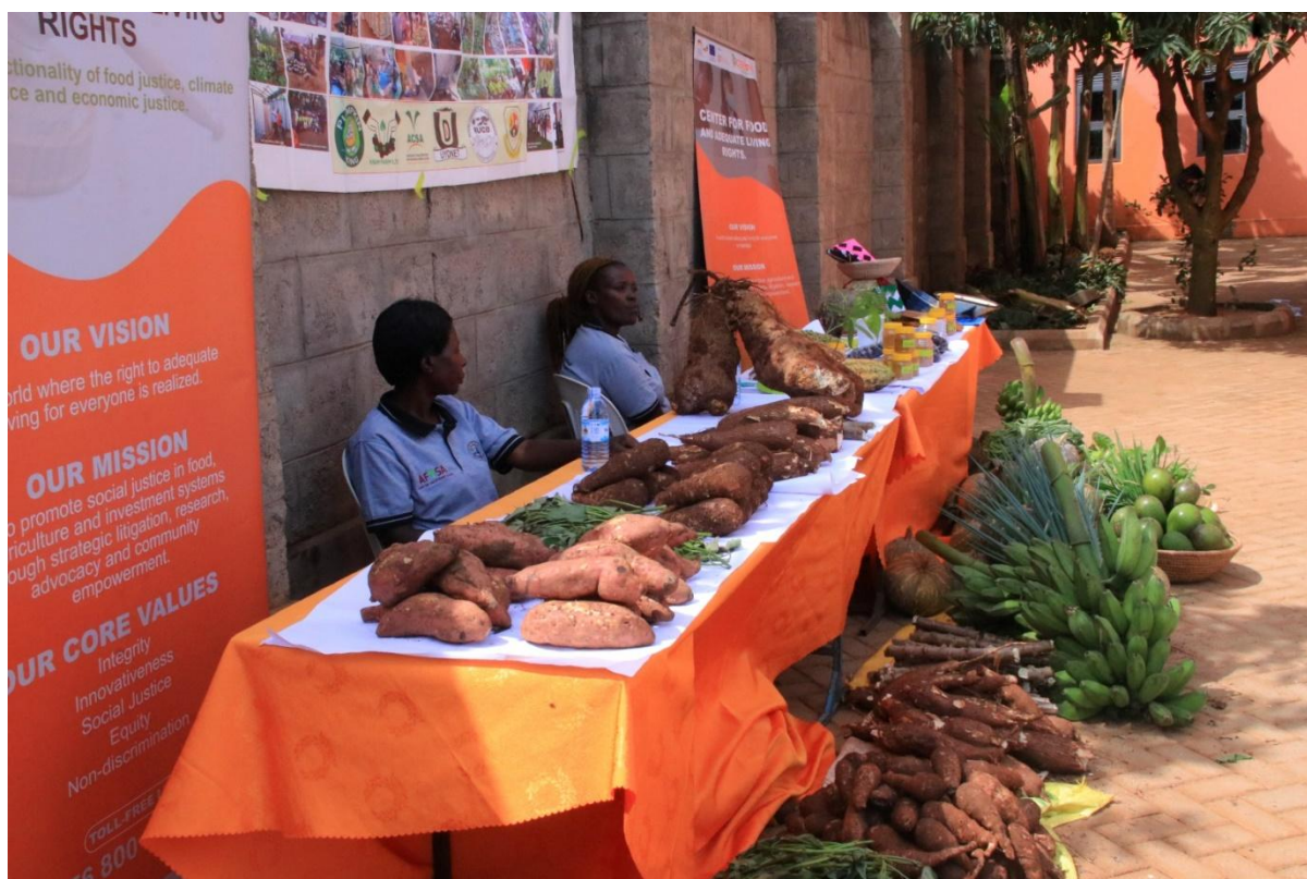
Farmers exhibit healthy agroecology products during the World Food Day Celebrations.