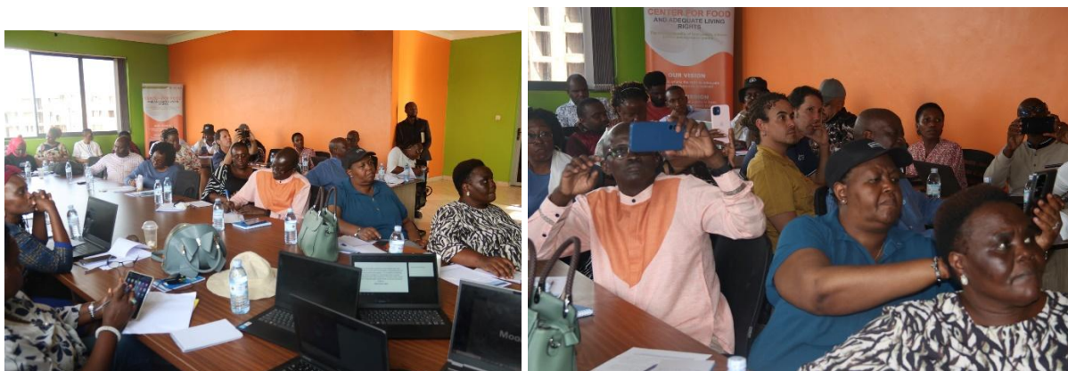
Members of the committee at CEFROHT offices during the capacity building training on agroecology promotion using Law and policy within the East Africa Region.

An engagement meeting with the committee including FAO representatives, CSOs, the loose collaborative, academia and agroecology farmers proceeded the healthy lunch. Understanding that policies formulated and enacted the East African level supersede national policies, CEFROHT presented a CSO position paper on promoting agroecology using the legal and policy framework within East African region highlighting the importance of creating institutional frameworks for agroecology strengthening and promotion of seed equity and food sovereignty within the East African region.