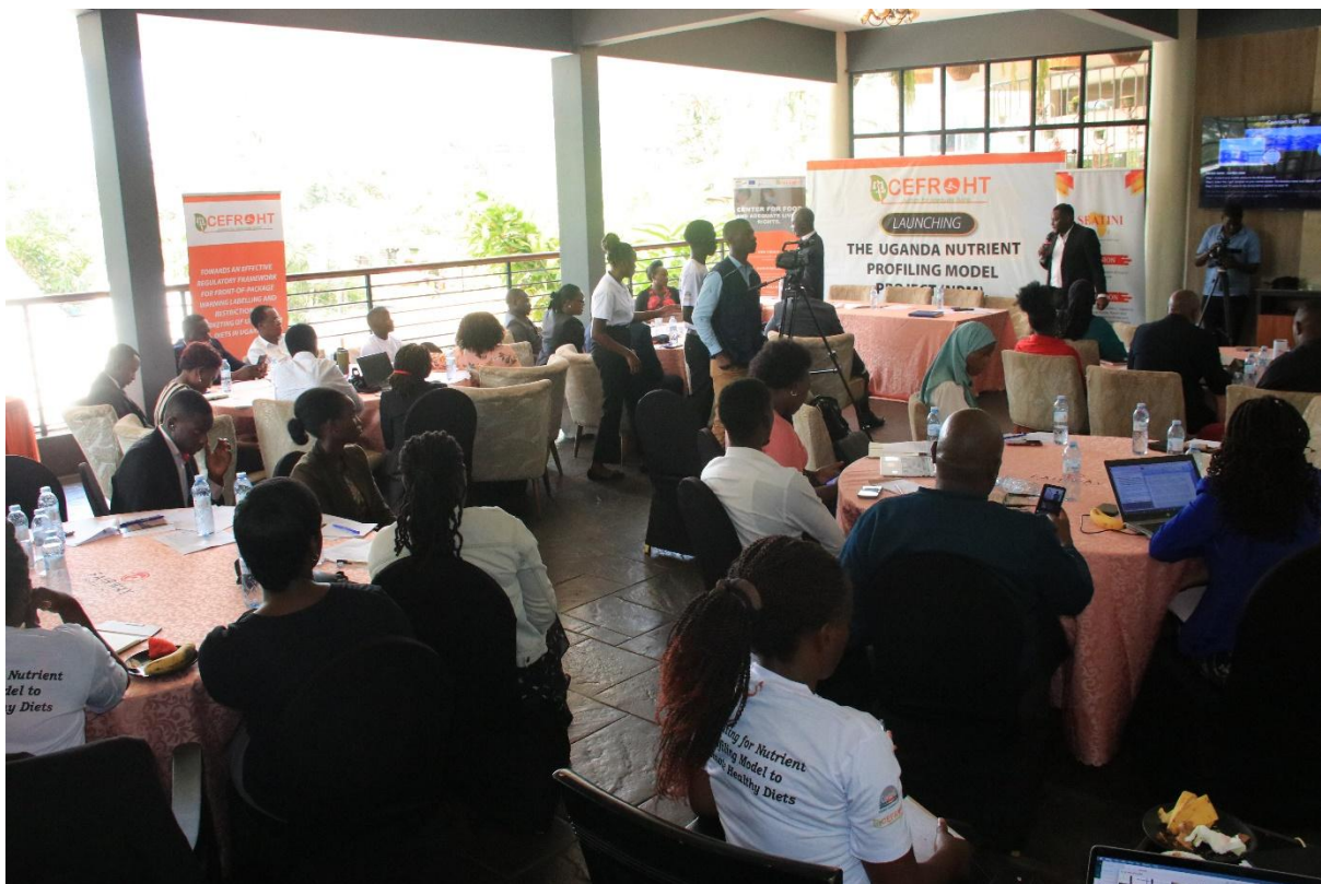
The National Multi-stakeholder dialogue on the NPM.