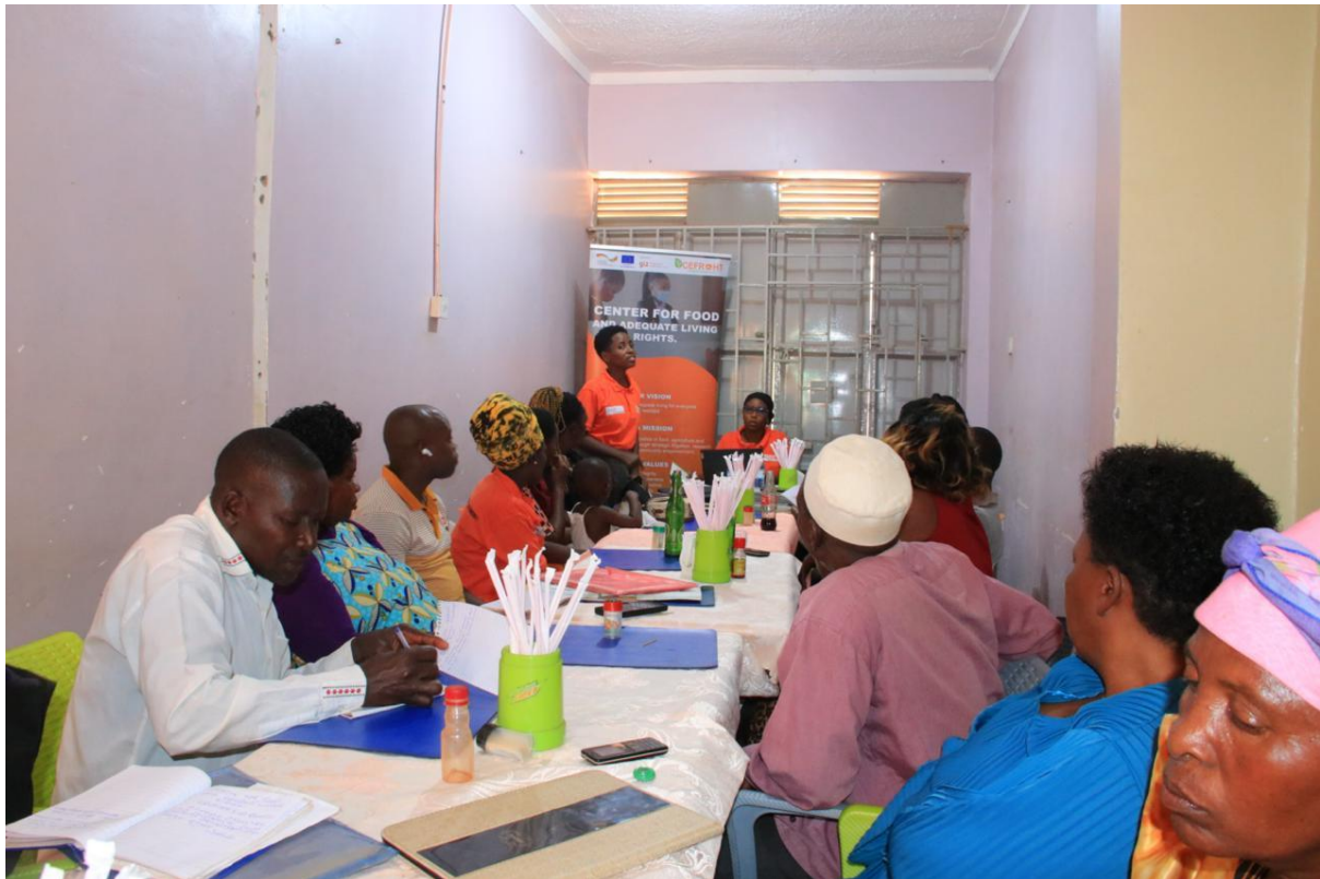
CEFROHT legal officers at capacity building training with the CAGs on the HREA.