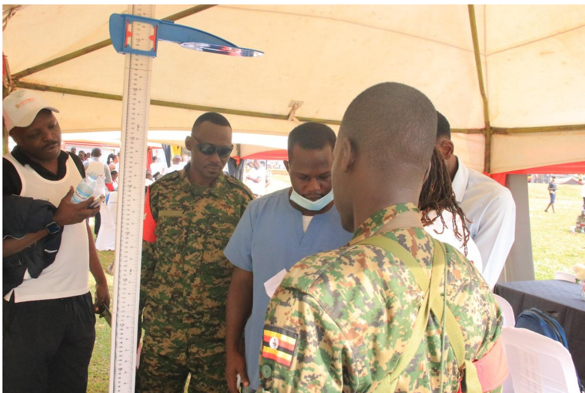
CEFROHT nutrition expert taking the BMI, and giving recommendations on diets and physical activity to participants at the CEFROHT stall.