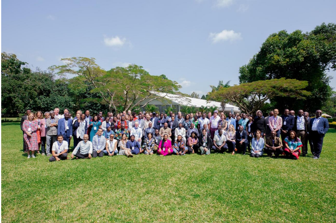
Participants from all over the world at the Cultivating Change gathering in Arusha, Tanzania.

CEFROHT joined the world at the “Cultivating Change Gathering” in Arusha, Tanzania. The gathering on regenerative and agroecology food systems transformation and philanthropy collaborative for fertilizer transition, mapping alignment for Global fertilizer transitions and collaborative action. CEFROHT exchanged insights from ongoing transition processes and regional discussions, and built relationships and connections with Agroecology partners, within and between countries and regions involved in agroecological transitions.