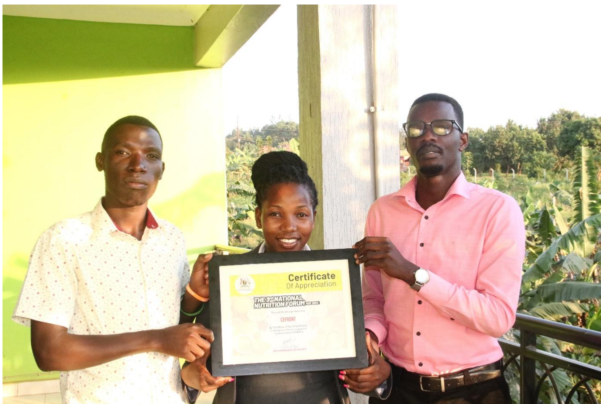
CEFROHT staff present a certificate of Appreciation received during the 2 nd National Nutrition Forum in recognition of CEFROHT's efforts towards promotion of healthy diets and Nutrition.