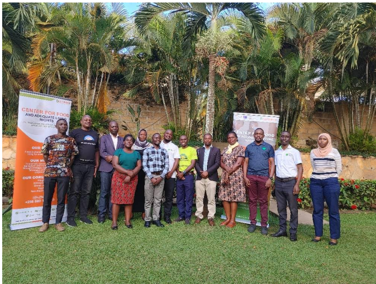
Members of the UNCC-FOPWL pose for a group photo

Together, the members of the coalition are presently pushing for evidence-based Front-of-Pack nutrient warning labelling regulations and a comprehensive national food and Nutrition policy in Uganda.