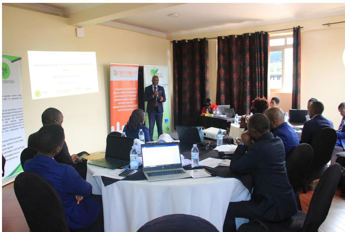
The Executive Director, CEFROHT giving a key note address during the lawyers' meeting.

The UNCC-FOPWL led by FIAN-Uganda held a legal practitioners' meeting with Ten (10) lawyers, majority of whom came from the Food and Nutrition Cluster of Uganda Law Society of to discuss how the legal minds can support the formulation and passing of NPM and FoPWL regulations. The lawyers through the meeting developed the following strategies to undertake in support towards the formulation processes of FOPWL regulations. The legal practitioners committed to, drafted and are implementing a legal strategy for the NPM project. The lawyers are now part of public campaigns to add a legal voice petitioning MoH to pass evidence-based NPM & FoPWL regulations and based on the human rights-based approach, the lawyers have filed a petition to the Minister of Health that will be delivered by a march as the Uganda Law Society to Ministry of Health Headquarters indicating the human rights and legal implications of not passing NPM & FoPWL regulations, and the urgent need to finalize the formulation processes.