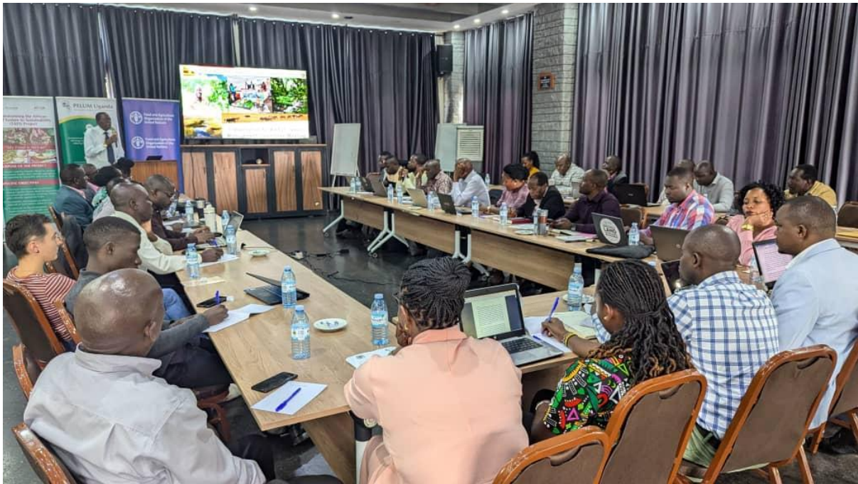
A multi-stakeholder consultative meeting for the National Agroecology Strategy (NAS) development.

group conducted a multi-stakeholder validation meeting for the NAS to understand the roles of different sectors and stakeholders, internalize the document and also provide input into a final document that was presented to MAAIF Sector Senior Management and awaits approval.