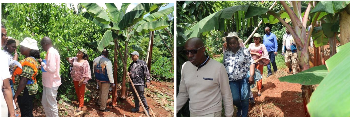
Members of the committee during the visit at one of the CEFROHT Agroecology Learning Centers in Mukono district.