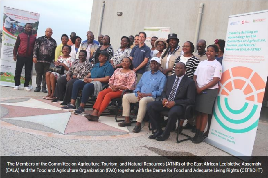
The Members of the Committee on Agriculture, Tourism, and Natural Resources (ATNR) of the East African Legislative Assembly (EALA) and the Food and Agriculture Organization (FAO) together with the Centre for Food and Adequate Living Rights (CEFROHT)

Kampala, Uganda – November 18, 2024 – The Committee on Agriculture, Tourism, and Natural Resources (ATNR) of the East African Legislative Assembly (EALA) and the Food and Agriculture Organization (FAO) in partnership with the Centre for Food and Adequate Living Rights (CEFROHT) signed a resolution officially recognizing agroecology as a strategic priority for formulating and recommending sustainable policies in agriculture, tourism, and natural resource management across the