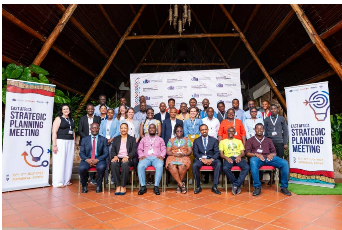
Regional partners from Kenya, Tanzania and Uganda at the East Africa Strategic Planning Meeting.

CEFROHT together with the coalition members attended the East Africa Strategic Planning Meeting organized by the International Institute for Legislative Affairs (IILA) and GHAI. The Strategic Planning Meeting not only that ensured bi-directional knowledge exchange among local partners, GHAI, regional partners on food policy advocacy but also built the capacity of regional partners on specific food policies such as the front-of-pack Warning Label (FOPWL) and the NPM. Participants were able to interact and learn from regional partners their local advocacy context and also develop synergies for collaboration towards evidence-based food policy promotion in East Africa.