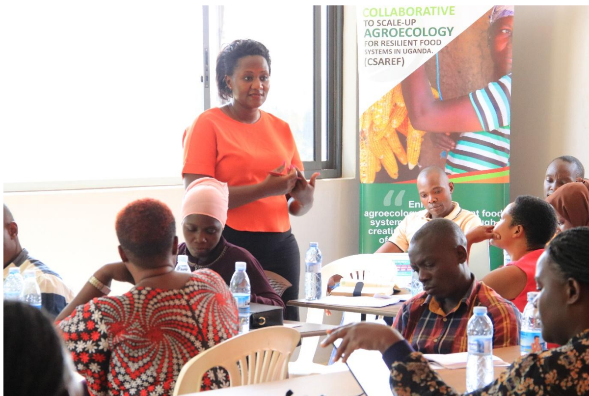
The Town Clerk, Kasangati town council making commitments to support women and youth agroecology farmers through government initiatives such as the PDM and the microscale irrigation program.