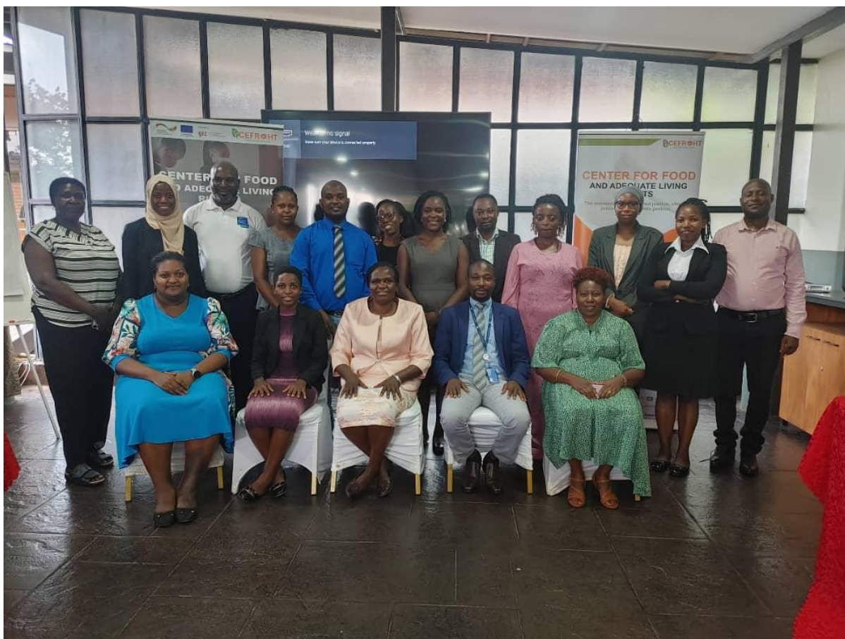
Members of the Ministry of Health Nutrition TWG at one of the TWG meetings.