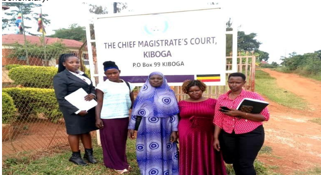
CEFROHT legal officer, beneficiaries, and the CAGs pose for a photo outside the Kiboga Magistrates court after obtaining justice.