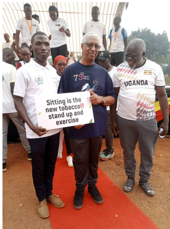
On the left, the Minister of Health and on the right, the WHO country coordinator for Uganda at the National Day of Physical Activity.