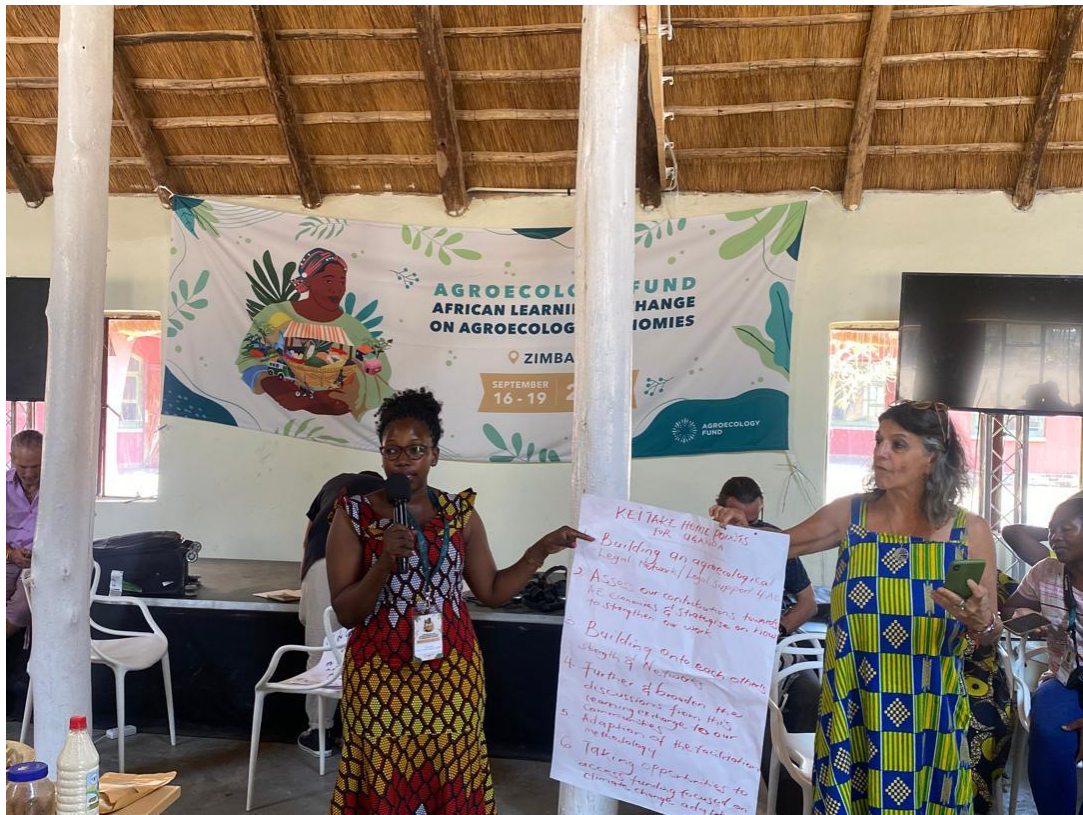
CEFROHT launches the Pan African Legal Network on Agroecology during the AEF tripartite event.