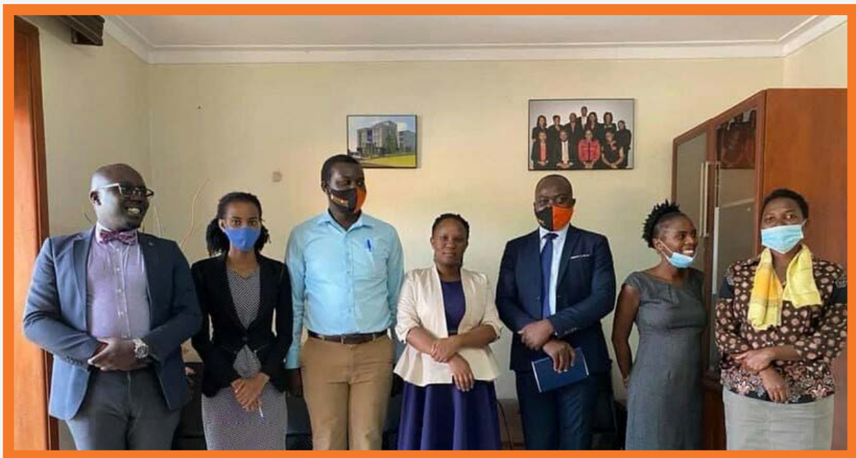
CEFROHT's partnership with Uganda Law Society to promote healthy diets and prevent NCDs using the law and fiscal policy

CEFROHT strategically engages in legal aspects impacting adequate living rights through framing food, nutrition, health, trade and investment issues as constitutional claims and entitlements and also does legal & policy advocacy, community empowerment and action research using a human rights based approach to promote adequate living rights.